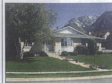
The Bringhurst Group

On the market: This home is in Sandy, in the East Bench section of Salt Lake City.