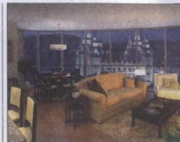
City Creek Reserve Inc.

Sugarhouse: One of the city's most desirable neighborhoods, filled with historic houses and bungalows built as early as the 1920s. Though it has mostly primary residences, second-home owners like its proximity to downtown and its location near Park City's three ski resorts, the Canyons, Deer Valley and Park City Mountain.