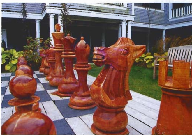
From top: What summer looks like: beachside at the Winnetu Oceanside Resort. Back on the lawn, time for your big move.

(Personalities among the young summer help at Winnetu appear to range from cheerful to dazzling.) Along the way we crossed a small bridge where, we were told, a scene from Jaws was filmed.