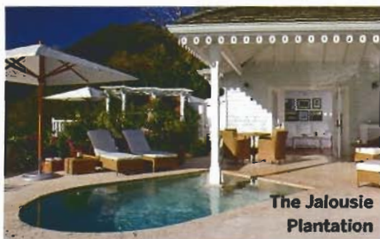
The Jalousie Plantation